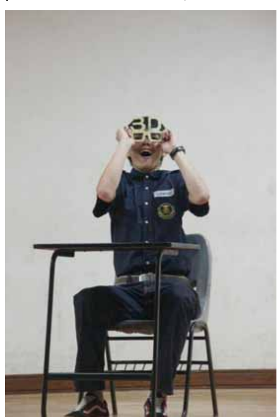
(Small skits in the night of physics)

In the night of physics, each grade will prepare own performance, without formal restriction but mainly small skits. Different grade has much different style. And we can know the feature of each grade. Some is local, some is bizarre, some is humor, and some is immature, but all are terrific. There are also other kinds of performances besides skits, such as band and dancing.