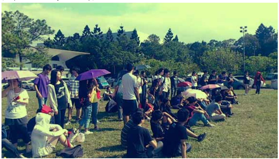
(Preparation of Orientation with Chinese Department of NHCUE)