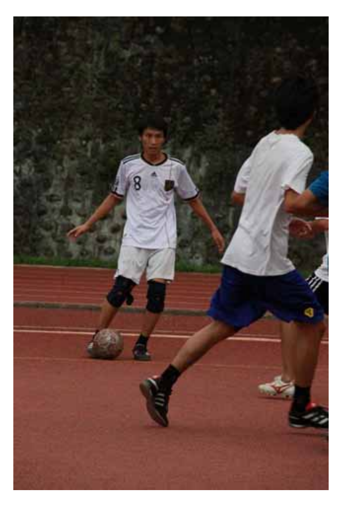
(Soccer Huan-Cheh Cup )