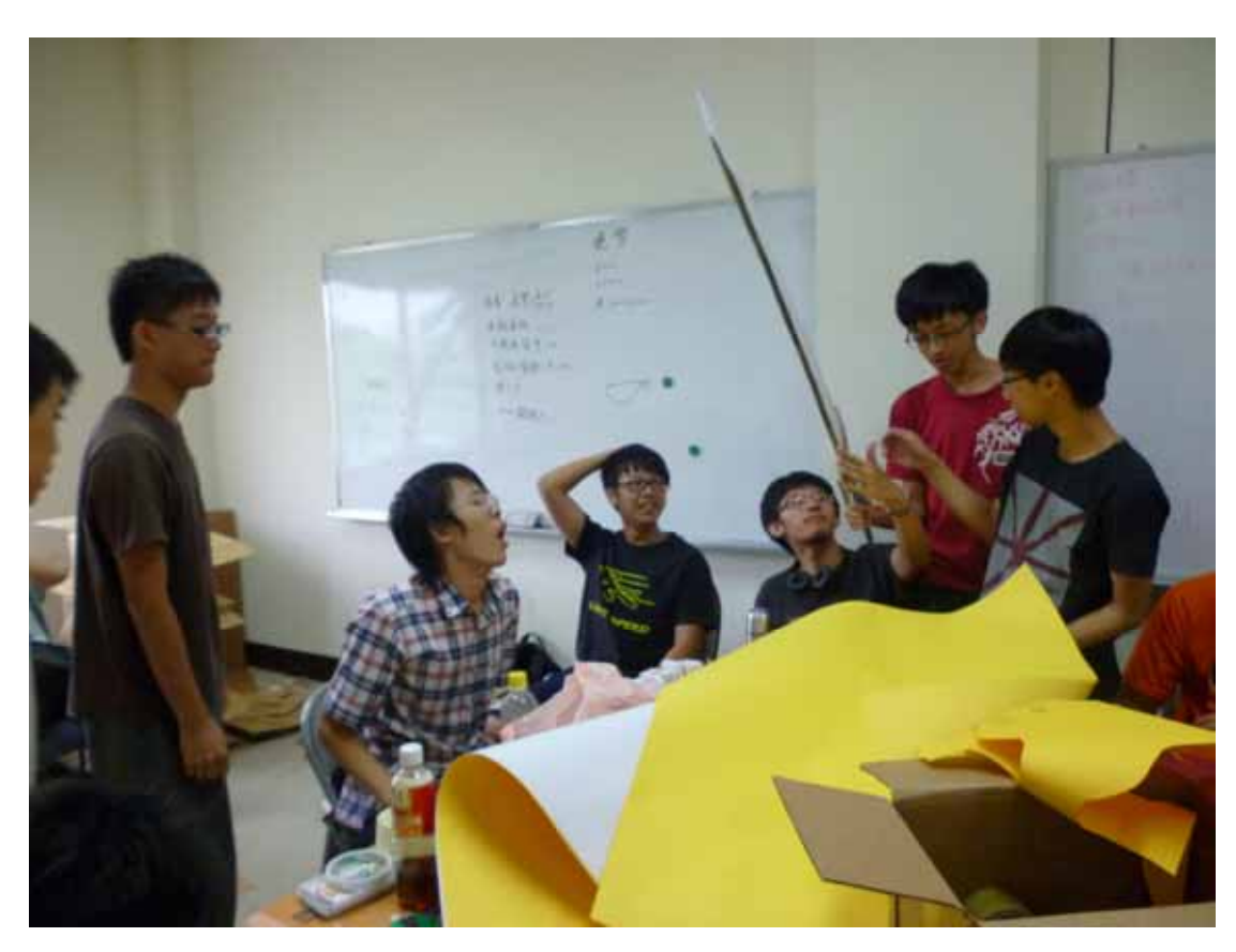
(Preparation of Physics Camp)