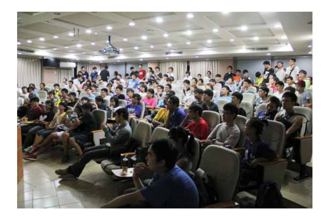
(The meeting of freshman in 2014)

As the freshmen advent, they will hold "the Meeting of Freshmen". The meeting of freshmen is to let freshmen introduce themselves, acquaint with their senior schoolmates and choose a sports team of department. The so-called directly schoolmates is the schoolmates whose last three numbers of school number are the same. The senior directly schoolmates usually give all of their previous schoolworks or textbooks to the junior. Several school numbers form a group, which is called "family". And the "family" will have dinner together in the midterm, called "reunine".