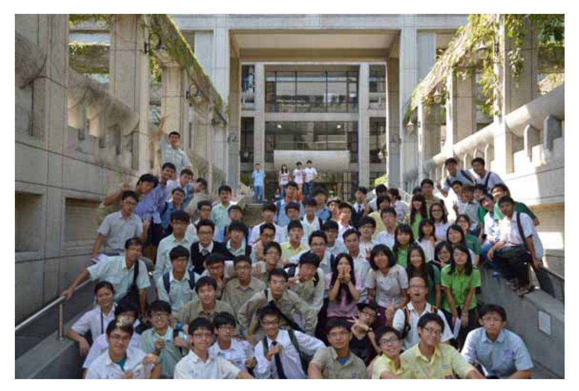
(All students in a picture in the day of uniform)