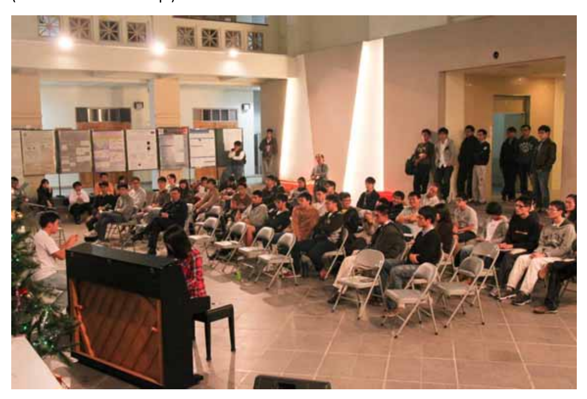
(the Huan-Cheh closing concert)