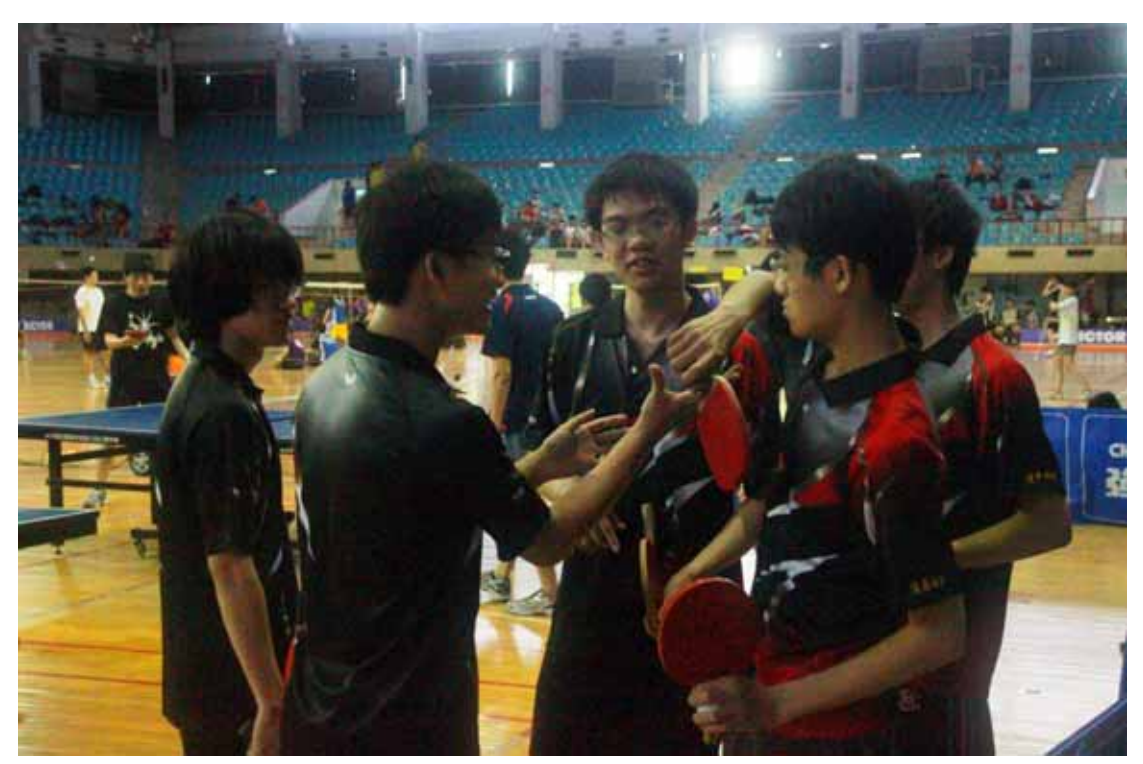
(Big Physics Cup)

Sports team of department might be the core of the activity in the department. While the Big Physics Cup held once a semester will be the most important thing in physics. Each physics department of all university in Taiwan alternately holds big Physics Cup. Physics students in all place come together, do the non-physical exercises. Big Physics Cup usually last two days. Thus students like to have a short tourism in the period.