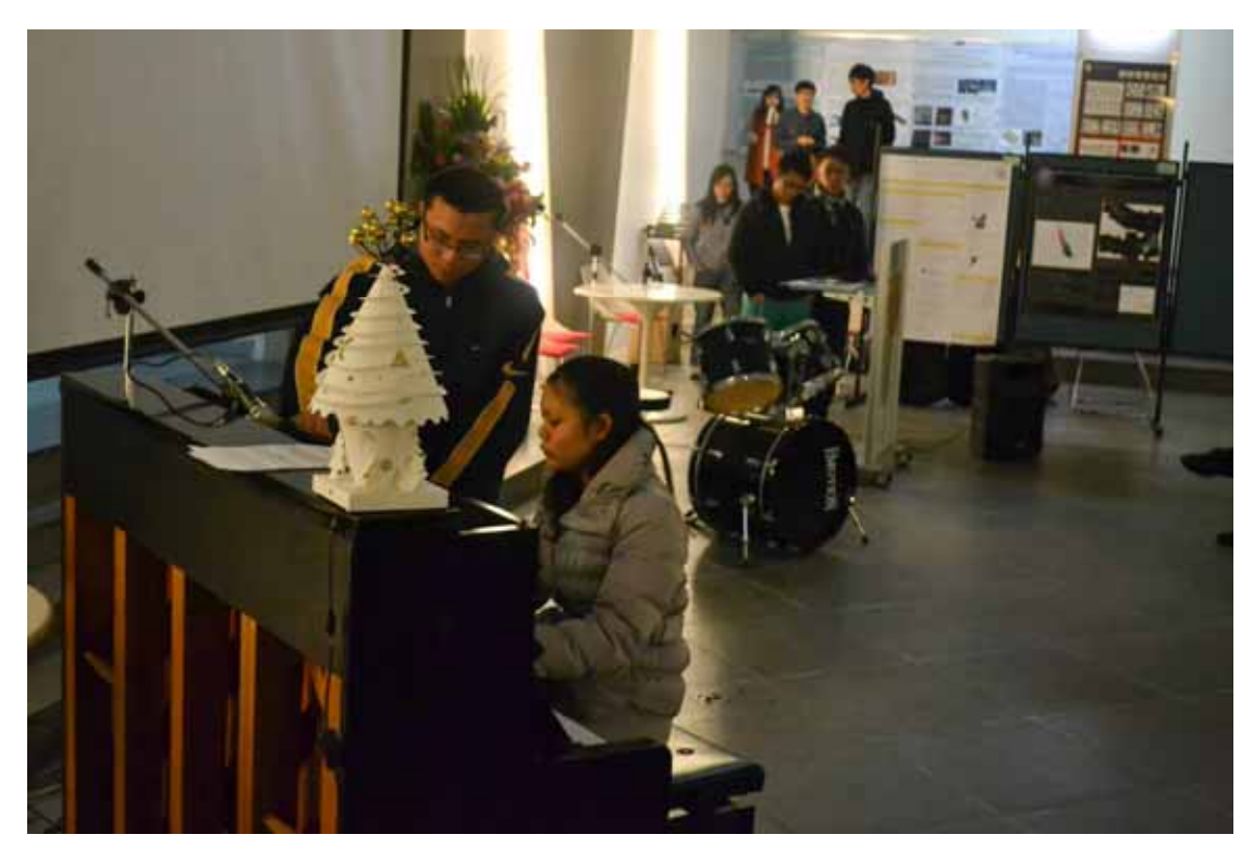
(the Huan-Cheh closing concert)