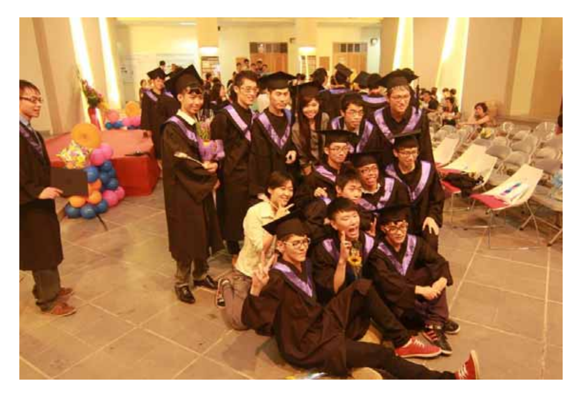
(Taking picture together in minor graduation ceremony)