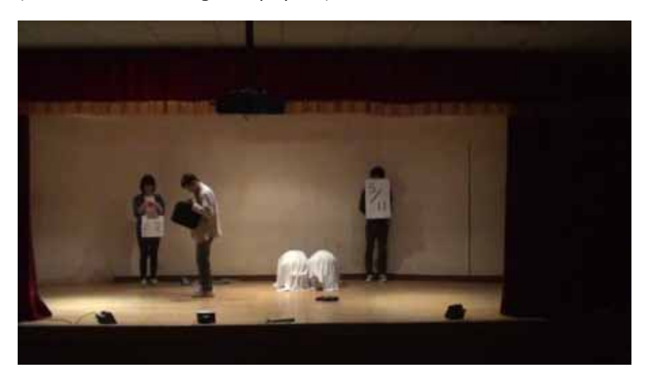
(Small skits in the night of physics)