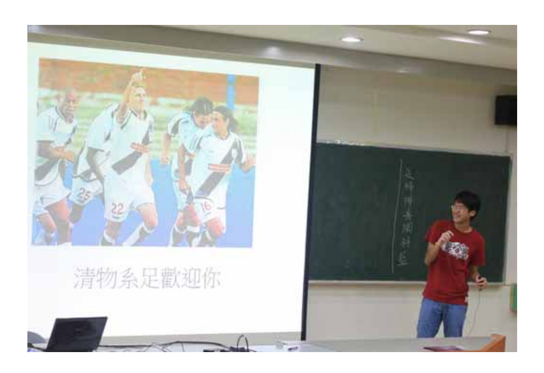
(Introduce of sports team of department)